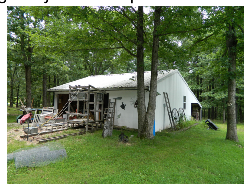
Antiques, Household & Misc.

Set of Four Vintage Winchester Store Posters consisting of Pheasant & Hunter, Squirrel & Hunter, Buck & Hunter, Rabbit & Hunter, all approximately 40" x 28" image size, all marked in margins "Copyright 1955 - Olin Mathieson Chemical Corporation Especially Painted for Western-Winchester", all framed under glass Collection of crocks 1 – 25 gallon (Misc. brands), Lot Crock bowls & jars, 2 – punched tin pie safes, Mirrored washstand, Small ornate oak table, 2- old metal peddle tractors, Deco cast iron smoking stand, "Dairy swing churn", Old 4 legged butcher block, Collection granite coffee pots, Flow blue tea set, "Gone with the wind" lamp, several Iron beds, 5' dry sink, Bavarian dishes, small corner cabinet. wash stand, Several primitive trunks, lot old wooden boxes, 2 yard gates, copper kettle & stand, dual metal glider, coffee grinder, Mirrored "tiger oak" dresser, Fenton carnival glass, Mechanical cast & wood school desk, Black forest deer shelf, Old game boards, vintage Santas, 4 - "Joan Rivers" Faberge eggs, lot costume jewelry, several composition dolls, Childs mirrored dresser, Antique oval table, Deco plant stand, small scales, cast iron floor lamp, 4 – metal lawn chairs, Leaded side lights, Metal toy truck, love seat, small table & chairs, Lightening rod w/globe & horse weather main, Wooden bucket, pressed backed chairs, Lot misc. glass & Primitives, Lot wood plains, Lot Misc. Hand & Power Tools