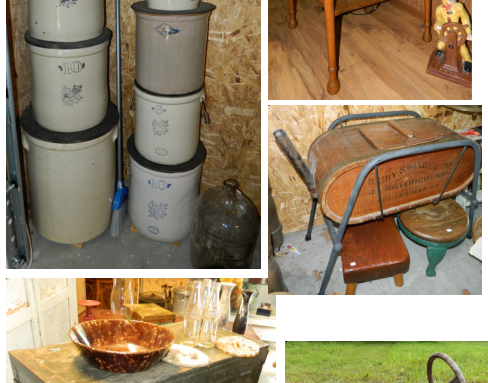
Many More Items too Numerous to Mention

Set of Four Vintage Winchester Store Posters consisting of Pheasant & Hunter, Squirrel & Hunter, Buck & Hunter, Rabbit & Hunter, all approximately 40" x 28" image size, all marked in margins "Copyright 1955 - Olin Mathieson Chemical Corporation Especially Painted for Western-Winchester", all framed under glass Collection of crocks 1 – 25 gallon (Misc. brands), Lot Crock bowls & jars, 2 – punched tin pie safes, Mirrored washstand, Small ornate oak table, 2- old metal peddle tractors, Deco cast iron smoking stand, "Dairy swing churn", Old 4 legged butcher block, Collection granite coffee pots, Flow blue tea set, "Gone with the wind" lamp, several Iron beds, 5' dry sink, Bavarian dishes, small corner cabinet. wash stand, Several primitive trunks, lot old wooden boxes, 2 yard gates, copper kettle & stand, dual metal glider, coffee grinder, Mirrored "tiger oak" dresser, Fenton carnival glass, Mechanical cast & wood school desk, Black forest deer shelf, Old game boards, vintage Santas, 4 - "Joan Rivers" Faberge eggs, lot costume jewelry, several composition dolls, Childs mirrored dresser, Antique oval table, Deco plant stand, small scales, cast iron floor lamp, 4 – metal lawn chairs, Leaded side lights, Metal toy truck, love seat, small table & chairs, Lightening rod w/globe & horse weather main, Wooden bucket, pressed backed chairs, Lot misc. glass & Primitives, Lot wood plains, Lot Misc. Hand & Power Tools