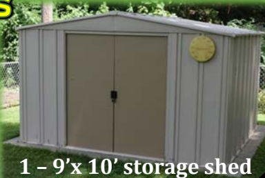
1 - 9'x 10' storage shed